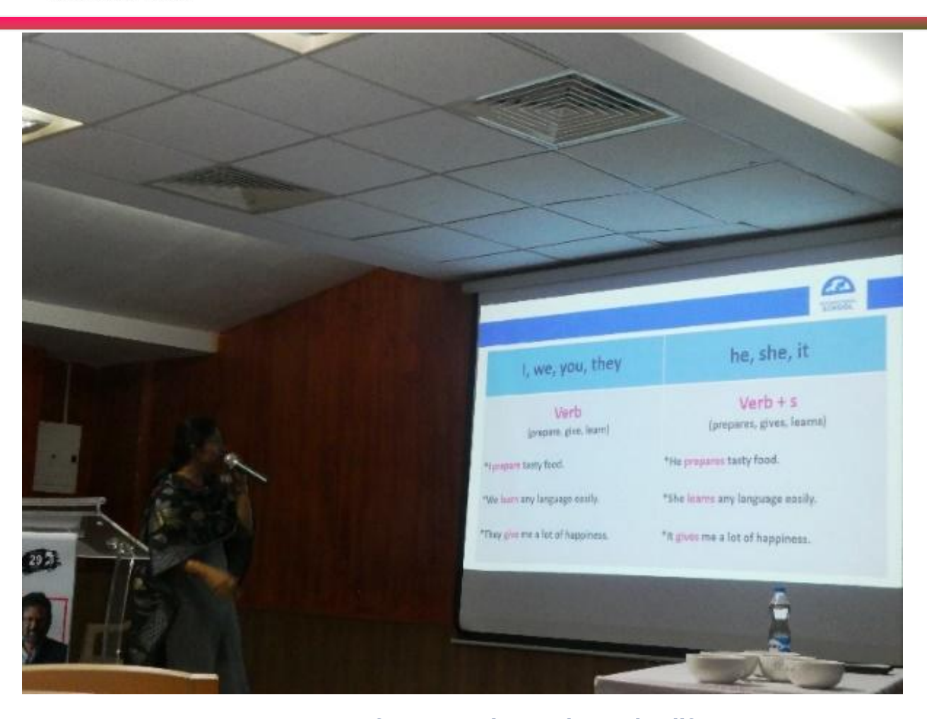
Correct usage of grammar in our day-today life.