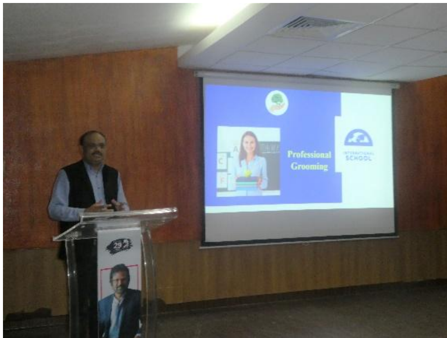
Principal, SVIS on the importance of Professional Grooming