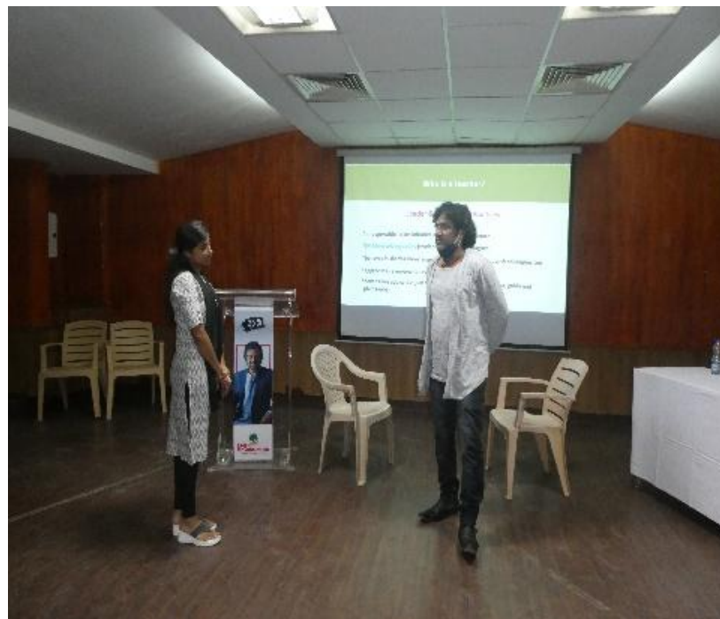
Teachers performing skit